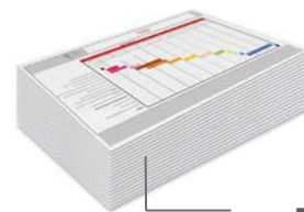
7,700 Sheets on-line